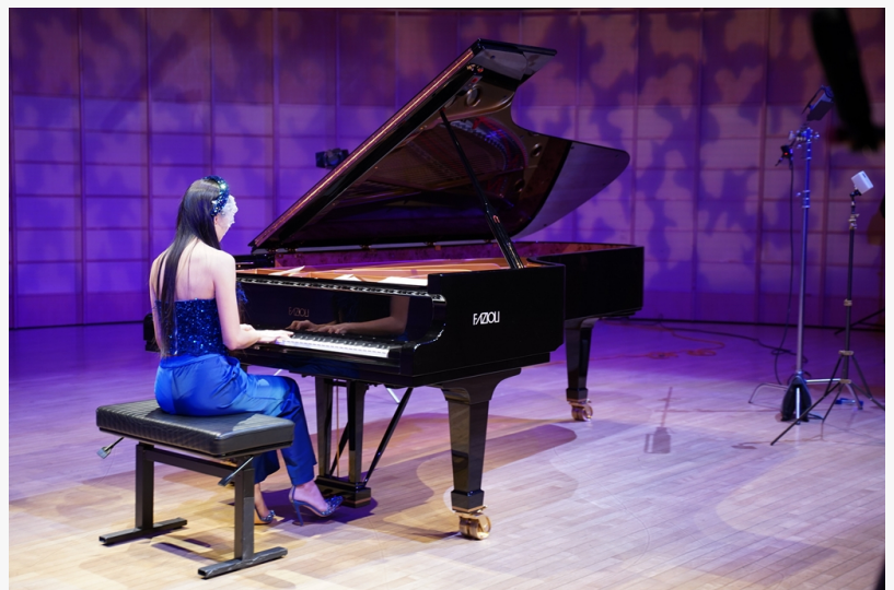
Miist at the Chan Center Vancouver BC

This press release can be viewed online at: https://www.einpresswire.com/article/684964741