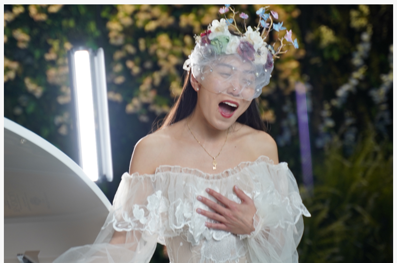
Miist with Butterfly Fazioli