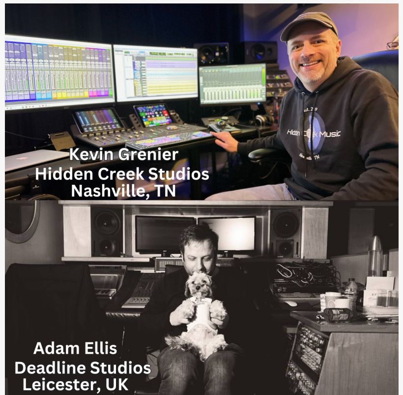
Recorded in the US and UK