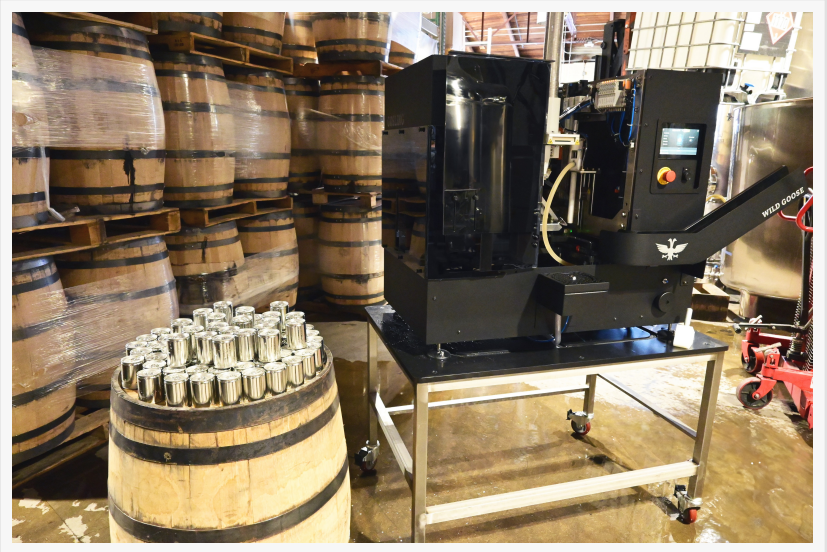
Gosling Spirit Canning System in Distillery

For faster speeds, the new Evolution Series Spirit builds on the foundation of Wild Goose's best-selling Evolution Series line used by more than 1,400 breweries and craft beverage producers around the world. The Evolution Series Spirit system provides upgradeability on the same platform and accommodates multiple can formats, including 100-milliliter steel cans alongside a range of traditional aluminum can sizes. The system is designed for higher-volume distilleries and co-packaging facilities, as well as