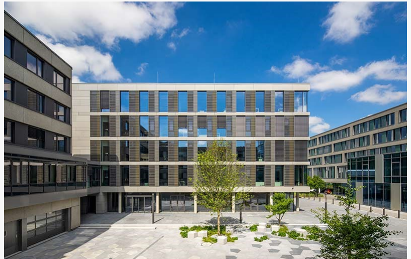
Electrochaea's headquarters in Munich, Germany