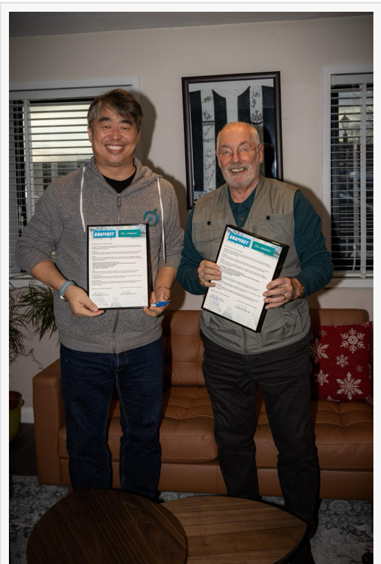
Snapfast & Grinergy MoU signing

Keywords: NetZero, sustainable energy, battery technology, MOU, UK-Korea partnership, Snapfast, Grinergy, renewable energy, lighting, energy storage, advanced batteries, cleantech,