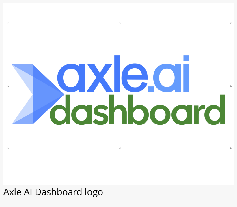
Axle AI Dashboard logo

Axle AI Dashboard's user interface can easily be reconfigured with open source modules