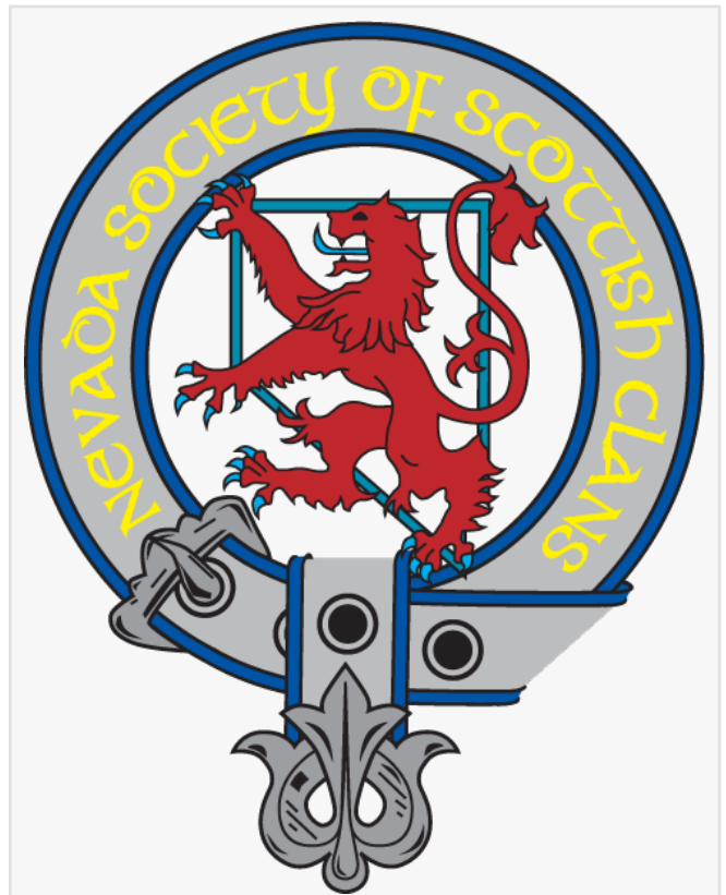
Nevada Society of Scottish Clans

The Nevada Society of Scottish Clans is a 501(c)3 non-profit organization founded in 1982 that is dedicated to the perpetuation of ancient customs, literature, music, games and dress of Scotland and its people. The Nevada Society of Scottish Clans promotes Scottish heritage through the annual dinner honoring the memory of Scotland's national poet, Robert Burns, sponsors Tartan Day, a summer picnic, Tartan Miniature Golf, a scholarship program and other activities. More