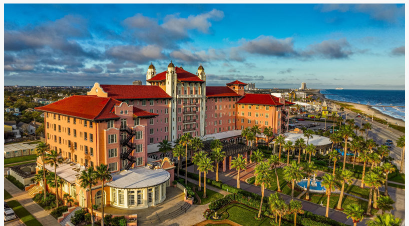
Grand Galvez, also known as Queen of The Gulf is the perfect Valentine's Day getaway