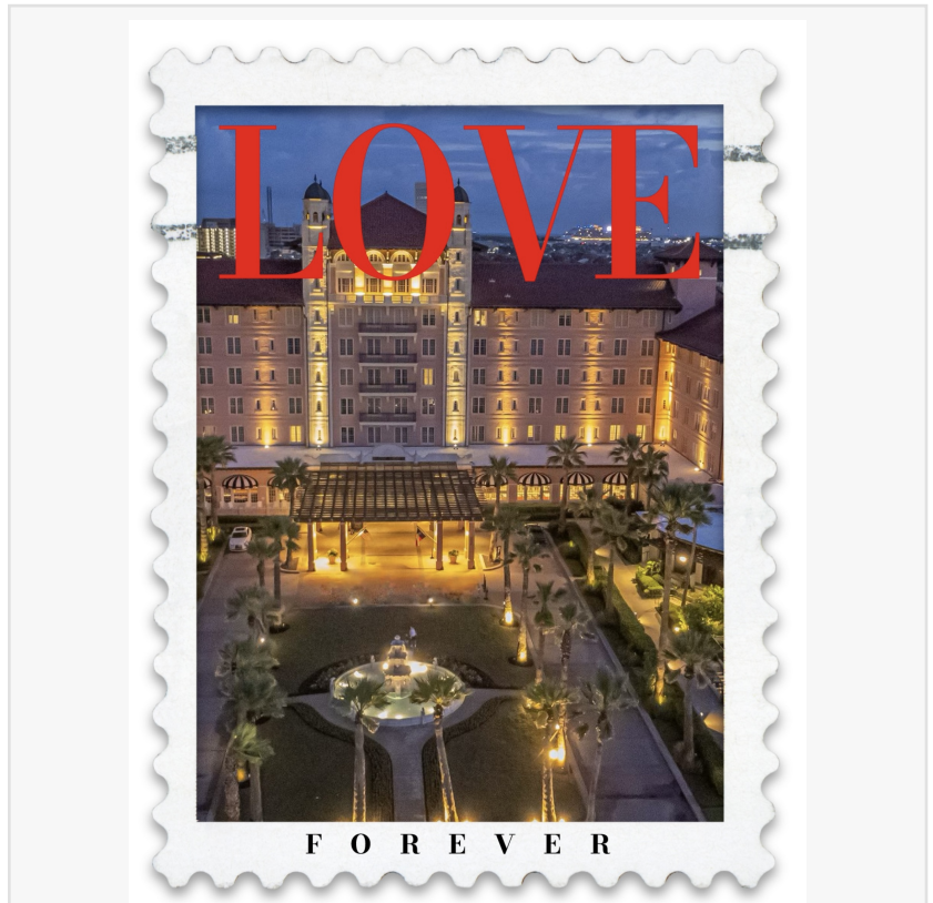
Love can be found at Grand Galvez

To reserve a spot for this unforgettable