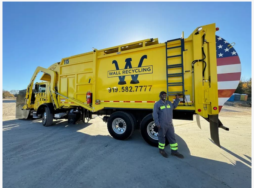
Picture of a Wall Recycling garbage collection & trash pickup truck.

WILMINGTON, NORTH CAROLINA, UNITED STATES, January 31, 2024 /EINPresswire.com/ -- Wall Recycling, a sustainable waste management provider in North Carolina, is excited to announce the expansion of its services to include a new residential trash pickup and garbage collection program in Wilmington. This move reinforces Wall Recycling's commitment to offering comprehensive waste solutions and trash services while contributing to the community's environmental well-being.