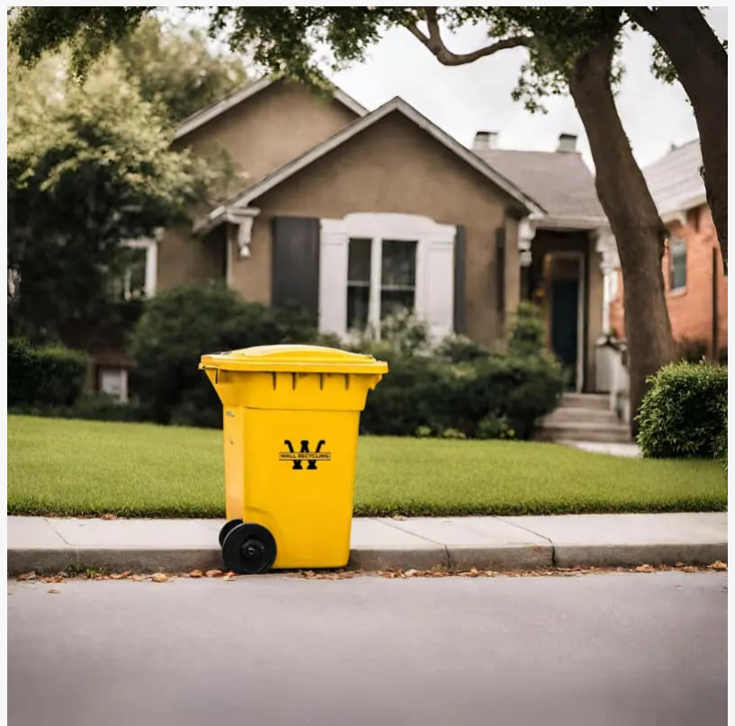
Picture of one a garbage collection bin from Wall Recycling.

Tailored to meet the diverse needs of businesses and homeowners, Wall Recycling's roll off dumpster rental services showcase their commitment to providing convenient, cost-effective, and environmentally responsible waste disposal options. Whether it's a commercial project or a residential endeavor, Wall Recycling's one-time bulk waste removal services aim to simplify the waste management process for clients while contributing to a cleaner, greener environment. Simply rent a roll off dumpster in Wilmington and schedule a time for waste removal.