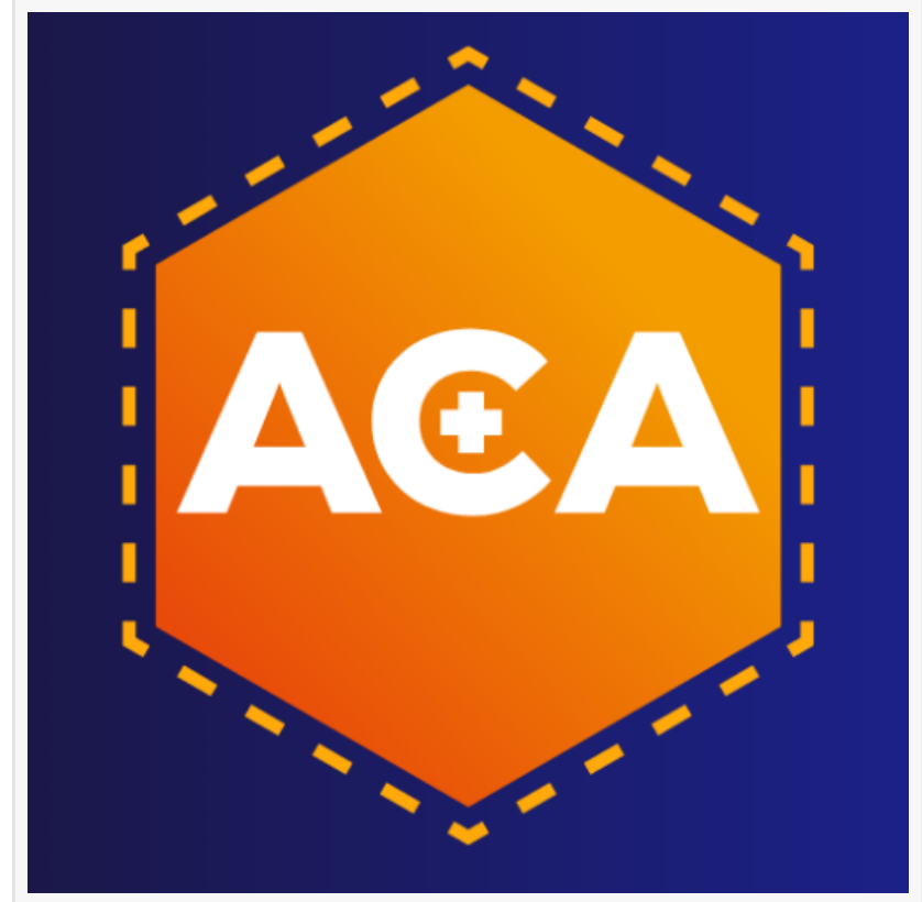
HRlogics ACA is part of the HRlogics Compliance Hive

Employment & Income Verifications, and Unemployment Cost Management.