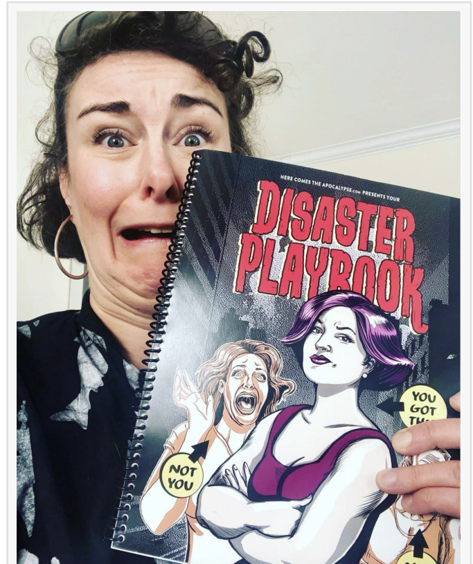
HCTA Founder with the first copy of the Disaster Playbook

With a background in web and graphic design, Heller wanted to approach the subject from a new