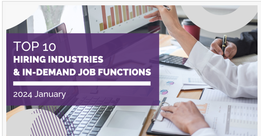
2024 January - Navigating Talent Trends Cover Photo