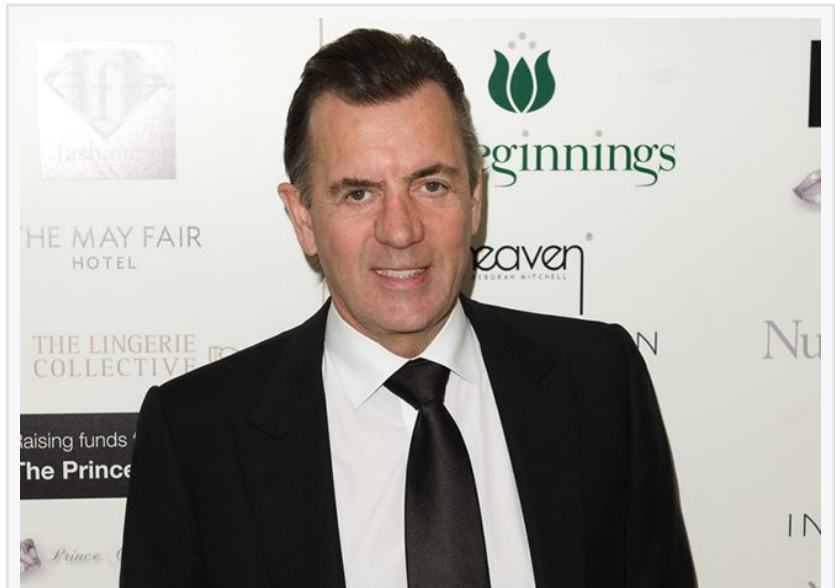
Duncan Bannatyne OBE Joins Board of Westbrooke Associate's Latest Investment Opportunity

CRAWLEY, WEST SUSSEX, UNITED KINGDOM , February 1, 2024 /EINPresswire.com/ -- Around 3,000 participants representing 120 nations gathered in Davos, Switzerland, for the 54th Annual Meeting of the World Economic Forum. Esteemed leaders, including Chinese Premier Li Qiang, French President Emmanuel Macron and Ukrainian President Volodymyr Zelenskyy, delivered noteworthy speeches.