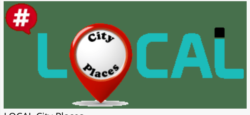
LOCAL City Places

experiences through business reviews and guide the decisions of future customers.