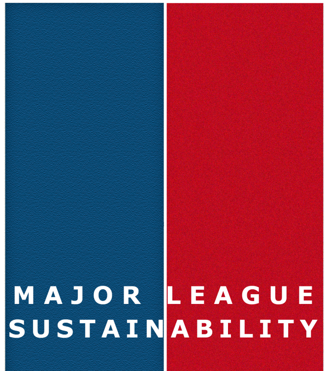
Major League Sustainability Logo

This ground-breaking report focuses on the teams competing in Major League Soccer (MLS), marking a significant advancement in understanding, and improving the ESG footprint, within professional sports.