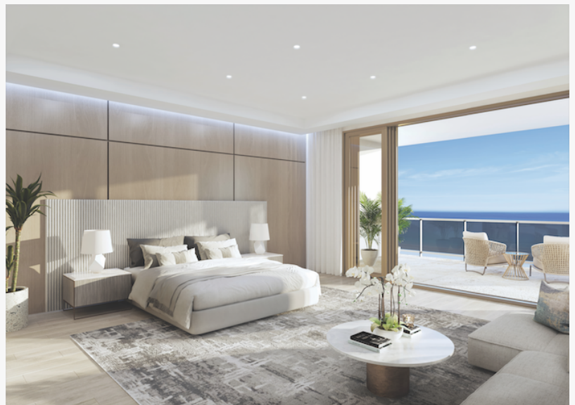
Interior rendering of bedroom.