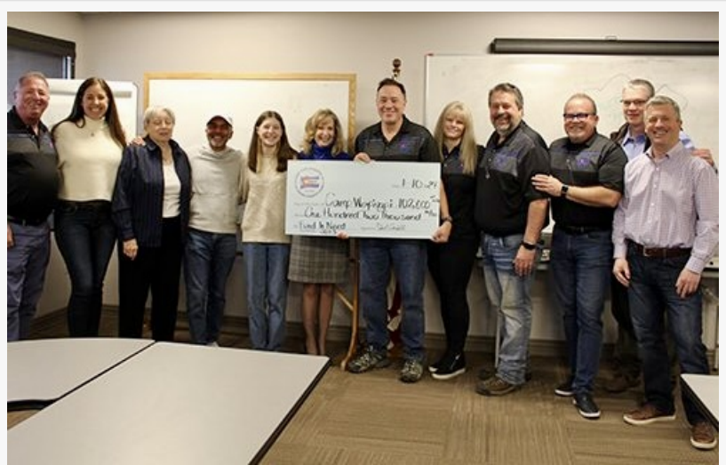
Members of CIADA present Camp Wapiyapi with a $102,000 donation

Camp Wapiyapi is a unique camping experience where children facing pediatric cancer can regain a sense of normalcy and enjoy just being kids again. Patients set aside their struggles to enjoy activities rooted in traditional fun but catered to any physical limitations. Siblings, who feel neglected as a family's focus shifts, find a community that understands them. Supported by compassionate counselors and medical staff, campers grow in friendship and confidence while parents have time for themselves to reconnect, which is an integral step towards continued healing within the family. Founded in 1998, the public charity provides programming free of charge by partnering with socially responsible companies and individuals to raise funds. Wapiyapi, a Lakota Sioux word that means 'health and healing,' has promoted mental healing for over 2,000 children since its formation and is a registered 501(c)(3) nonprofit. Learn more at https://www.CampWapiyapi.org/