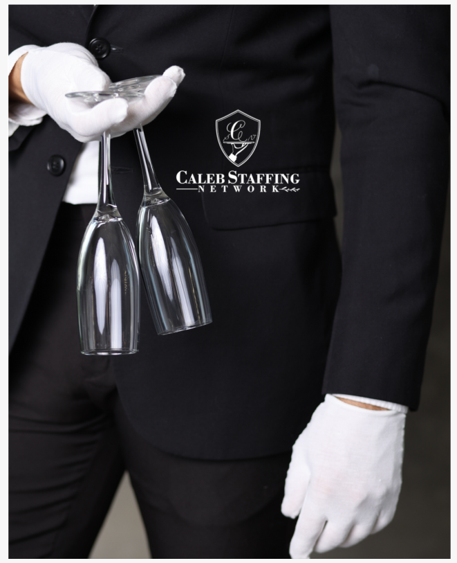
Caleb Staffing Network

CSN operates under a single guiding principle: elite staffing, where quality takes precedence. The mission centers on empowering the community to reach the pinnacle of the industry. CSN Professionals possess strong skills, selfsufficiency, and a commitment to delivering highquality service. Their attention to attire and grooming reflects CSN's focus on professionalism and quality standards.