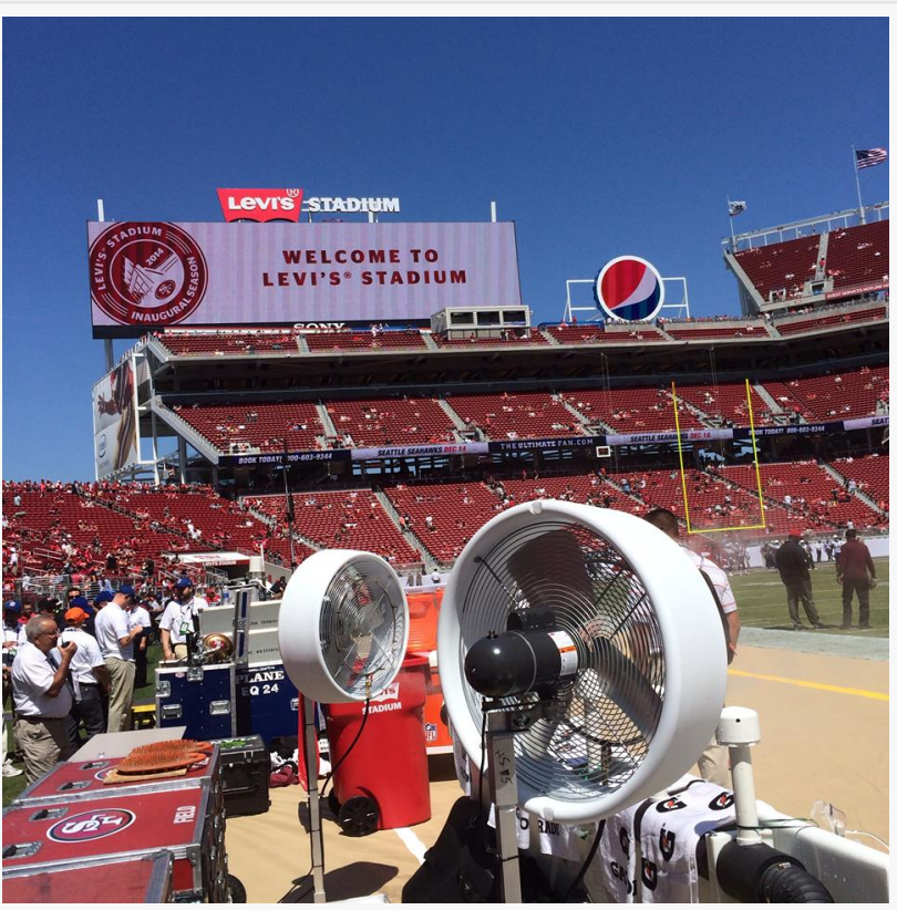
Big Fogg Misting Fans on 49ers sideline 2