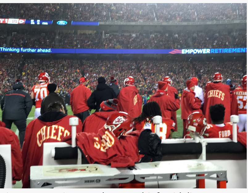
Big Fogg Heating Benches on Chief's sideline -

This press release can be viewed online at: https://www.einpresswire.com/article/685904627