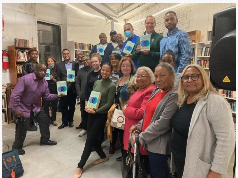
Book Celebration □ Word Up Book Store □ Washington Heights, N.Y.