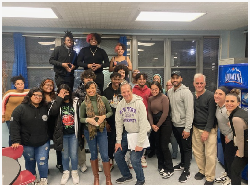
Teen Activists and Adult Civic Mentors □ Uptown Youth Collective □ Manhattan, N.Y.