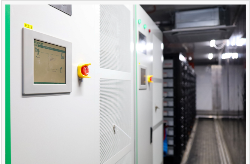
Wattstor battery energy storage system - an internal view of the container