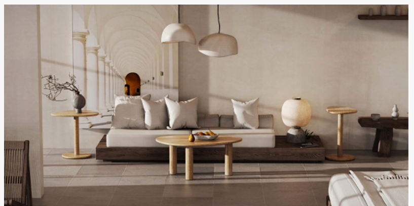
SwanEgg Coffee Table Set, Crafted in Italian Classico Travertine, in a living room setting

OIXDESIGN was founded with the vision of democratizing the luxury and beauty of marble furnishings. The company has navigated numerous challenges, including the natural weight and size constraints of marble and various environmental and financial obstacles, to create products that embody elegance and are available to a broad audience.