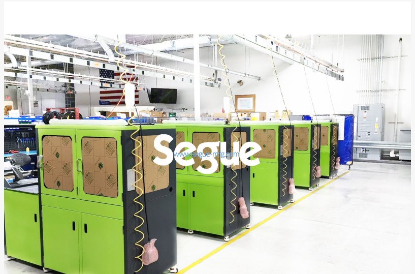
Segue Manufacturing Services - Large Complex Electromechanical Specialists in Boston