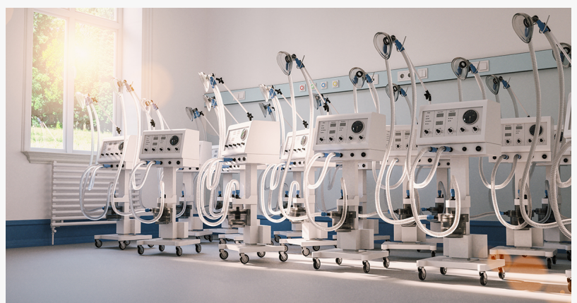
Segue Manufacturing - Complex Medical Device Expertise

BOSTON, MASSACHUSETTS, USA, February 5, 2024 /EINPresswire.com/ -- Segue Manufacturing Services, a 30-year contract manufacturing leader specializing in medical design and manufacturing for complex electromechanical devices and cable and wire harness assembly , today announced it will be attending MD&M West.