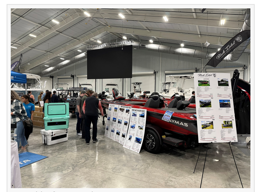
Board before you buy!

About Ballantine Management: With a rich history spanning more than 20 years, Ballantine Management has been a leader in consumer event production in Virginia, Pennsylvania, and Florida. Our extensive portfolio includes boat shows, craft fairs, pet shows, RV expos, home exhibitions, bridal showcases, sports expos, and much more. Each event we produce is a testament to our commitment to providing exceptional experiences for both attendees and exhibitors alike.