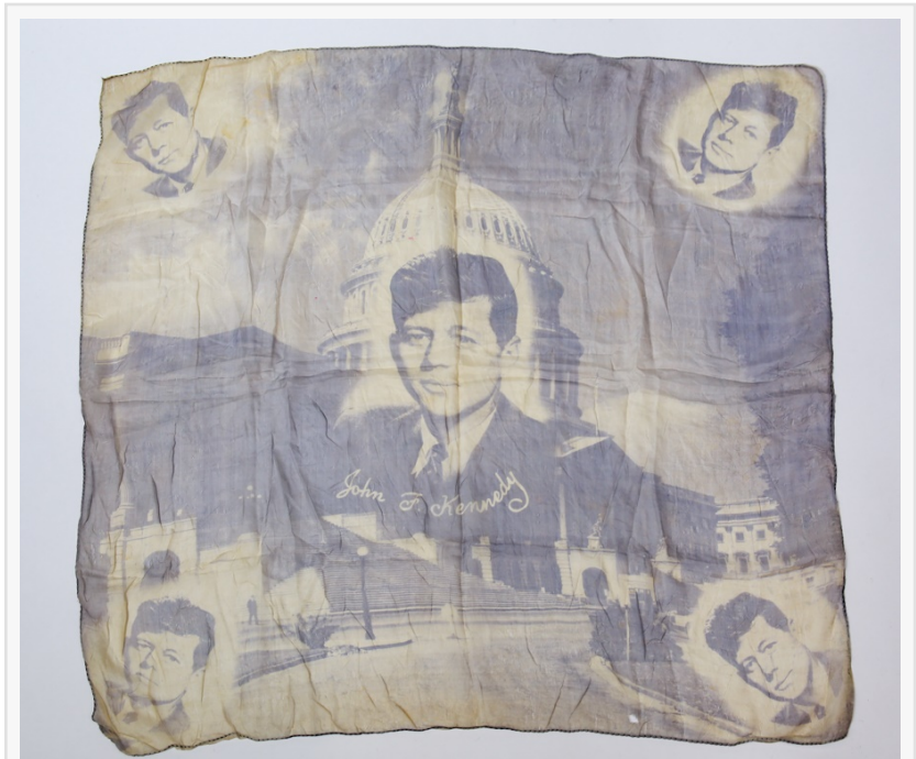
Lot 307 is a rare 1952 silk scarf promoting JFK's U.S. Senate bid, 30 by 33 inches, with images of Kennedy (est. $500-$1,000).

Lot 503 is a group of four photographs, three of Jackie Kennedy and daughter Caroline and one