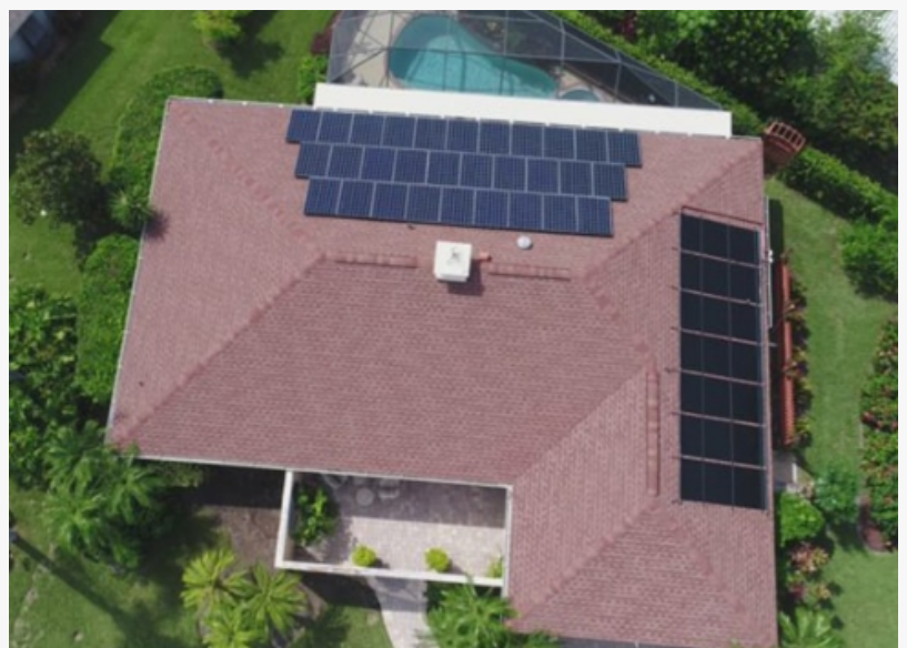
Mirasol Residential Solar

Formed in 1977, Mirasol Solar, formerly known as Mirasol FAFCO Solar, Inc, is one of the most established solar companies in Florida. Mirasol Solar has spanned three