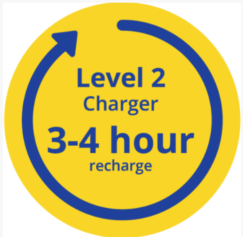
Mirasol - EV Charging Fast