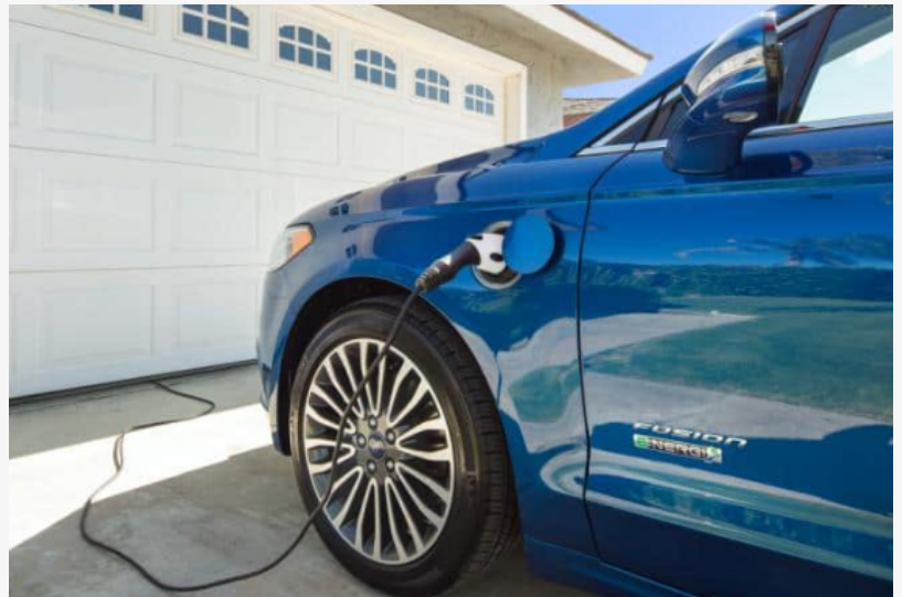
Charging an EV