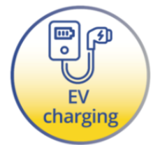
Mirasol Solar + Battery + EV Charger