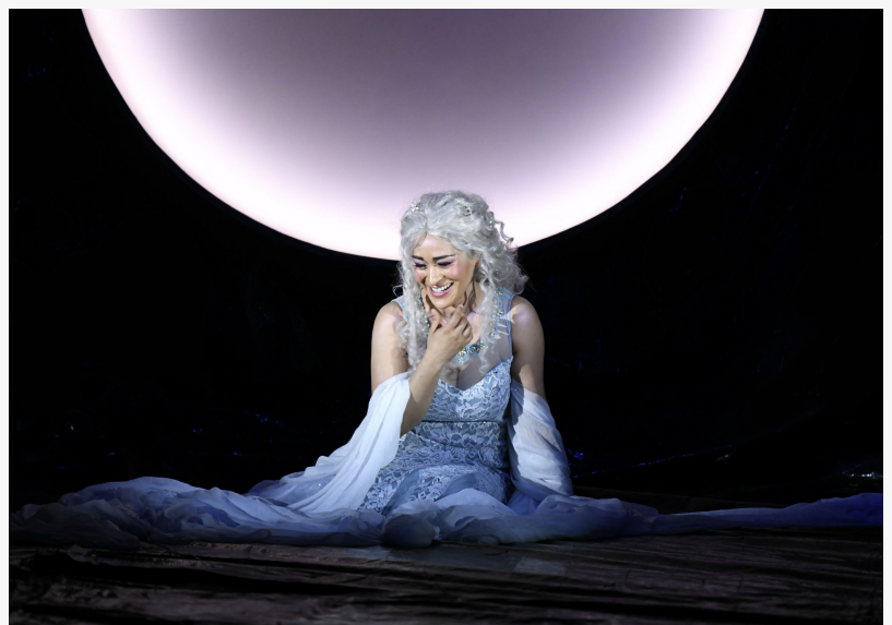
Cecilia Violetta López as Rusalka, 2023