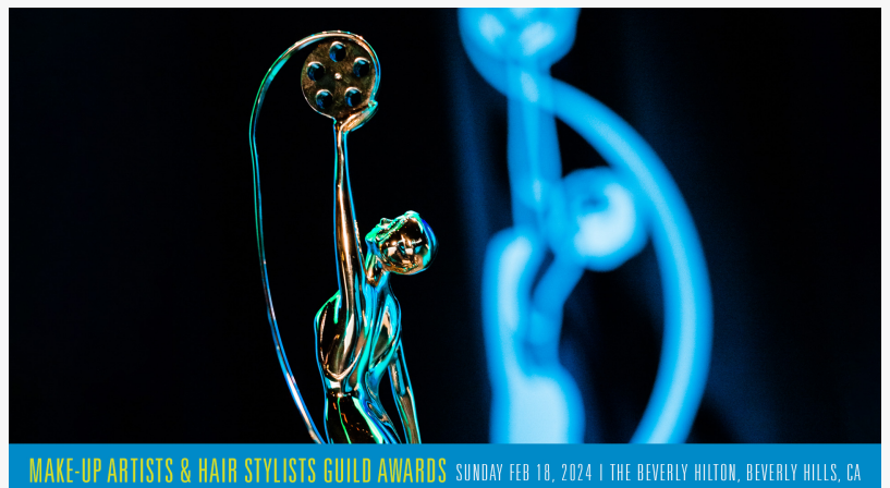
MAKE-UP ARTISTS & HAIR STYLISTS GUILD AWARDS SUNDAY FEB 18, 2024 | THE BEVERLY HILTON, BEVERLY HILLS, CA