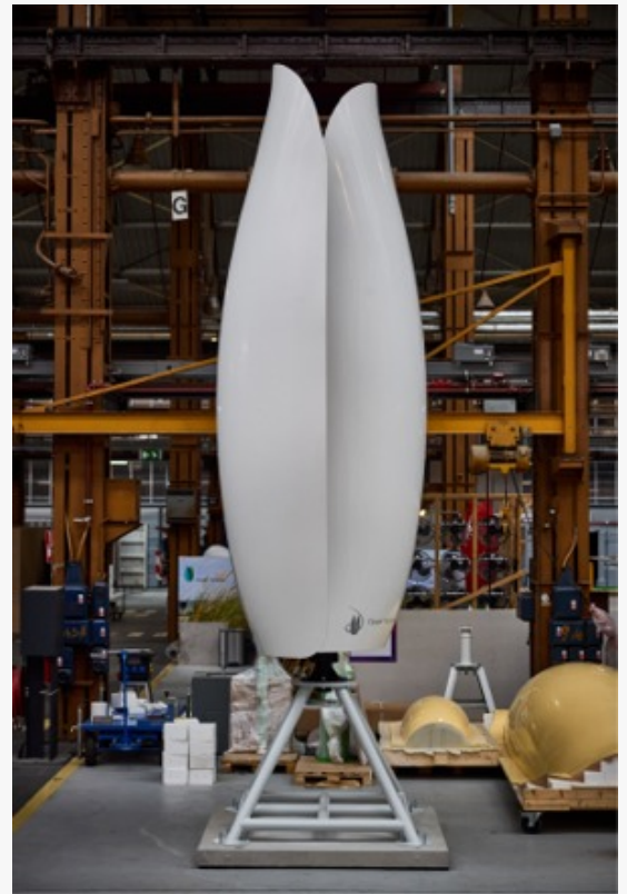
Large Size Turbine

This press release can be viewed online at: https://www.einpresswire.com/article/686528041