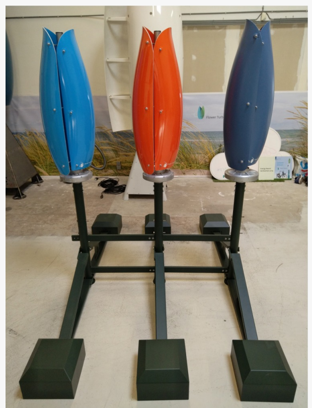
Colored EcoRoof Energy Hub

- Winner of the Dutch government sustainability award for two separate years.