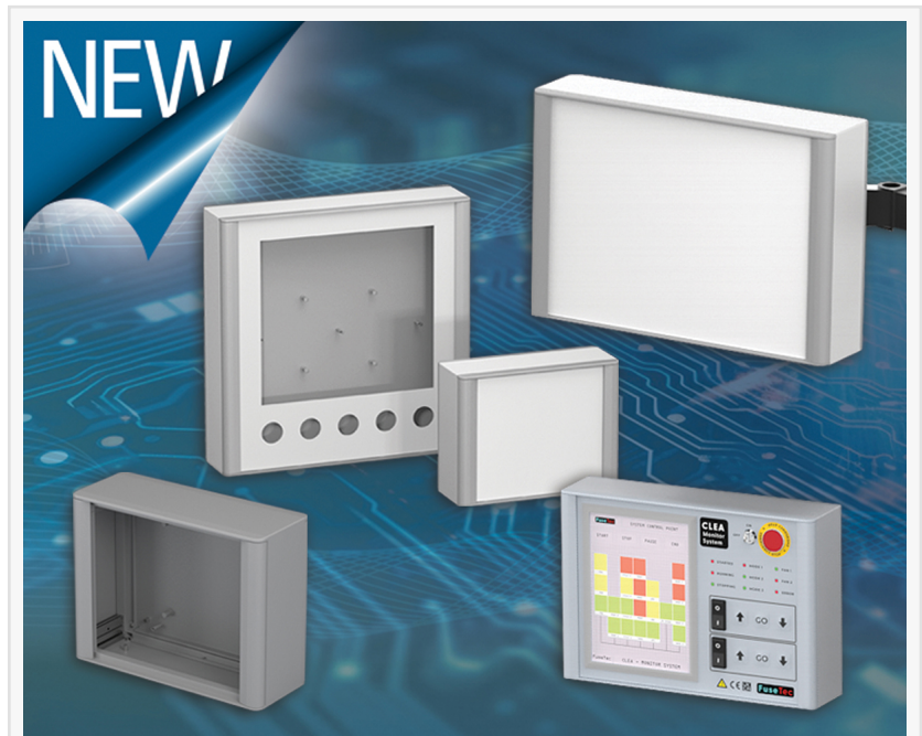
New TECHNOMET-CONTROL VESA-mount aluminum enclosures for touch screens, displays, panel PCs and HMI electronics.

Inside, the assembly extrusions have M3 holes and guide rails to hold internal plates, and the rear panel has M3 PCB pillars. All the case panels are fitted with M4 threaded pillars for earth connections. Some studs can also be used with retaining straps to secure the front and rear