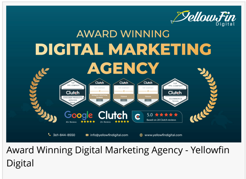
Award Winning Digital Marketing Agency - Yellowfin Digital

HOUSTON, TEXAS, UNITED STATES, February 8, 2024 /EINPresswire.com/ -- In the competitive landscape where small businesses strive to stand out against industry giants, YellowFin Digital, a full-service digital marketing agency , has launched its enhanced SEO services for Houston's small businesses. This initiative aims to level the playing field, allowing small businesses to upscale their online presence and foster significant growth.