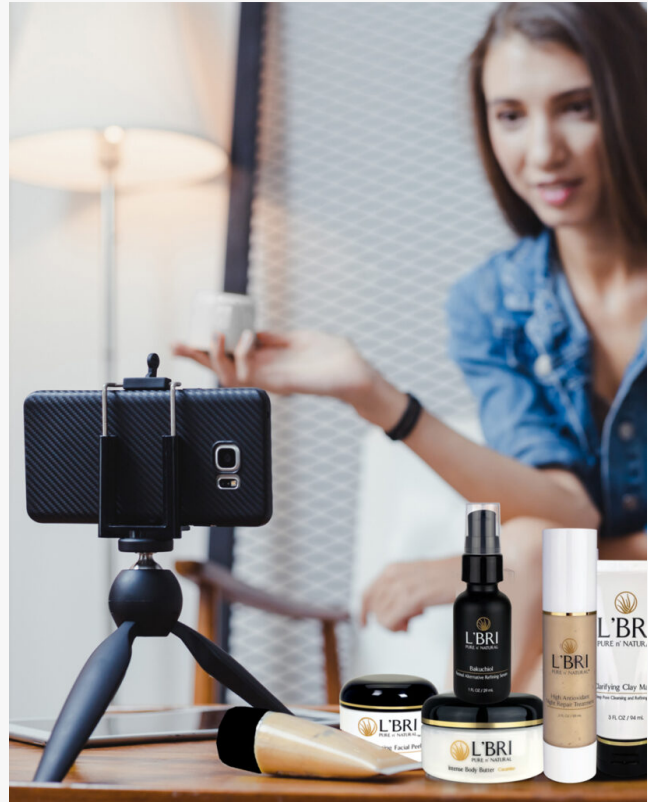
L'BRI LIVE SHOPPING EXPERIENCE