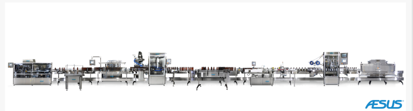
Aesus Packaging Machine Line