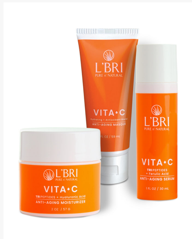
Group of L'BRI Vita C Skin Care