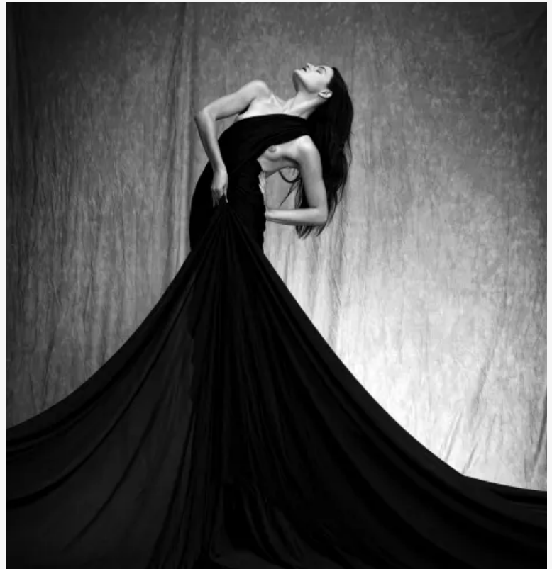
AIM #1, 2023