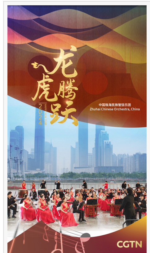
The MV "Rising Dragons, Leaping Tigers" features musicians and their instruments from different countries and cultures.

This musical collaboration extends beyond the participation of international percussionists. The Ensemble Baroque Update from Belgium breathes life into centuries-old European instruments