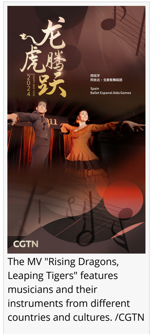
The MV "Rising Dragons, Leaping Tigers" features musicians and their instruments from different countries and cultures.

This press release can be viewed online at: https://www.einpresswire.com/article/686884023