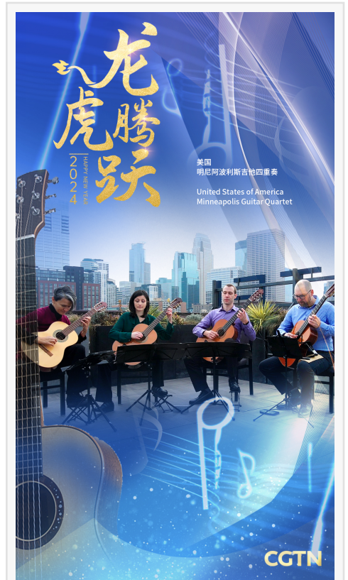
The MV "Rising Dragons, Leaping Tigers" features musicians and their instruments from different countries and cultures.