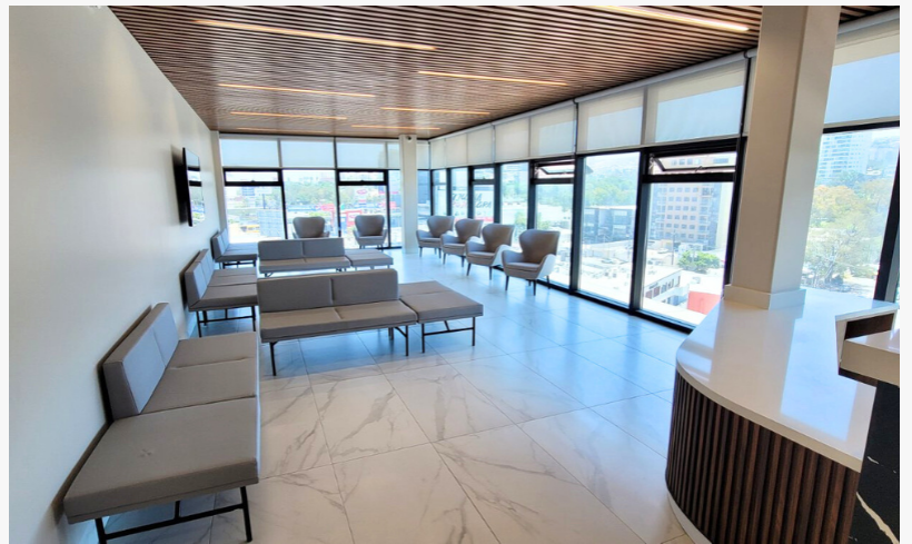
Hospital AZAR® waiting area

Each floor of Hospital AZAR is equipped with its own fully-stocked pharmacy and an around-the-clock team of expert, bilingual nursing staff. On the top floor, four spacious operating rooms are dedicated to carrying out gastric sleeve , gastric bypass, and other bariatric procedures. AZAR is one of the few facilities in Mexico to house its own departments for Fluoroscopy (x-ray), Endoscopy, and Radiology, as well as an Intensive-Care Unit (ICU).