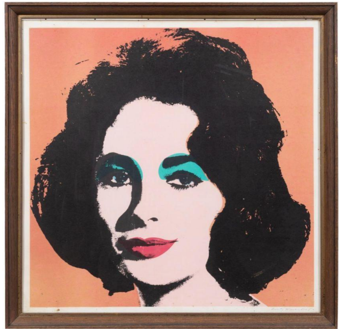
1965 offset lithograph in colors of Andy Warhol's (American, 1928-1987) iconic image of Liz (Taylor) on a bright red ground, signed and dated, from an edition of 300 (est. $25,000-$35,000).

Few artworks by Andy Warhol are as instantly recognizable as Liz. The offset lithograph in colors from 1965 depicts a close-up portrait of actress Elizabeth Taylor on a bright red ground. It's signed and dated '65' in ballpoint pen to the lower right margin, and is one from an edition of 300 printed by Total Color (N.Y.). The sheet size, less frame, is 23 inches by 23 inches. The estimate is $25,000-$35,000.