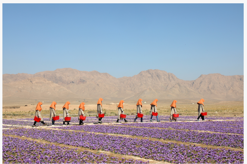
Women during the saffron harvest in Herat, Afghanistan harvesting Rumi Spice premium Afghan Saffron.

In the face of daunting challenges, the future holds a promise of hope for Afghan women. Rumi Spice remains a vital supporter of Afghan women's empowerment. By employing a dedicated team of women in roles ranging from field laborers to operations managers, the company not only highlights the indispensable contributions of Afghan women to the agricultural sector but also affirms the importance of their participation in the workforce. Rumi Spice's commitment to providing opportunities and fair wages to these women stands as a powerful example of how businesses can play a crucial role in fostering gender equality and economic development.