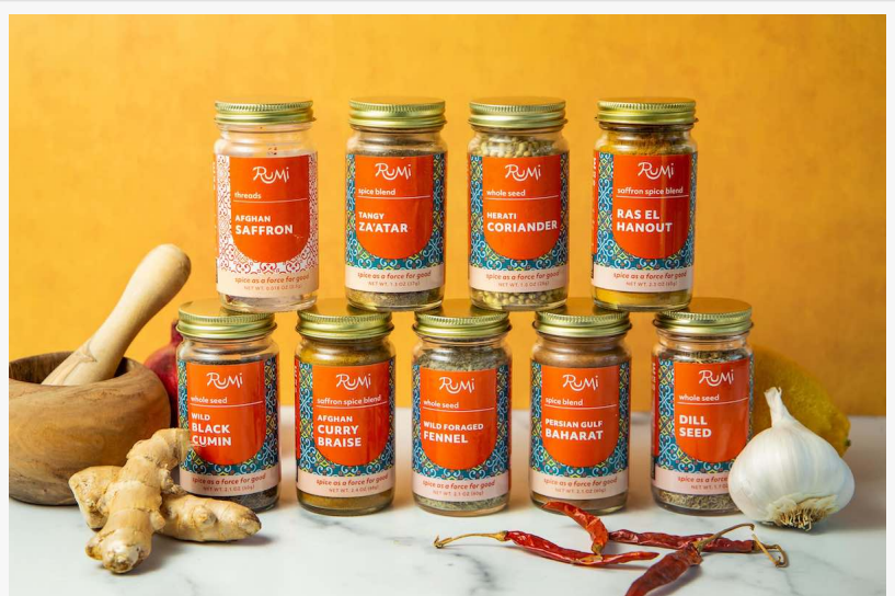
A selection of Rumi Spice's premium spices directly sourced from Afghanistan

This press release can be viewed online at: https://www.einpresswire.com/article/687189112