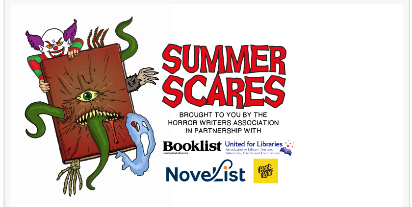
Summer Scares 2024 Logo