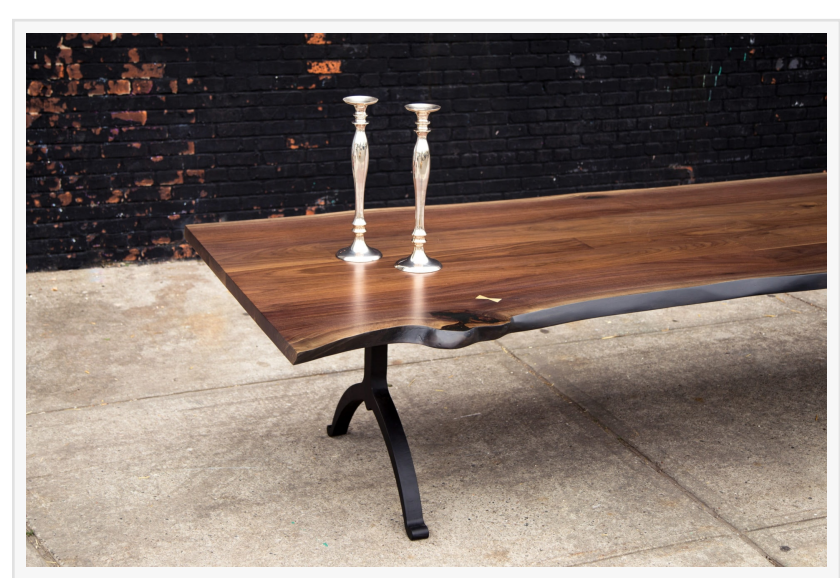
Signature Live Edge Table

BROOKLYN, NEW YORK, UNITED STATES, February 8, 2024 /EINPresswire.com/ -- Located at the heart of Brooklyn, New York, and renowned for its brand collaborations with names such as Marriot, Edition Hotels and Porsche, SENTIENT Furniture is now open to visitors who enjoy fine furniture with exceptional artistic savoir-faire.