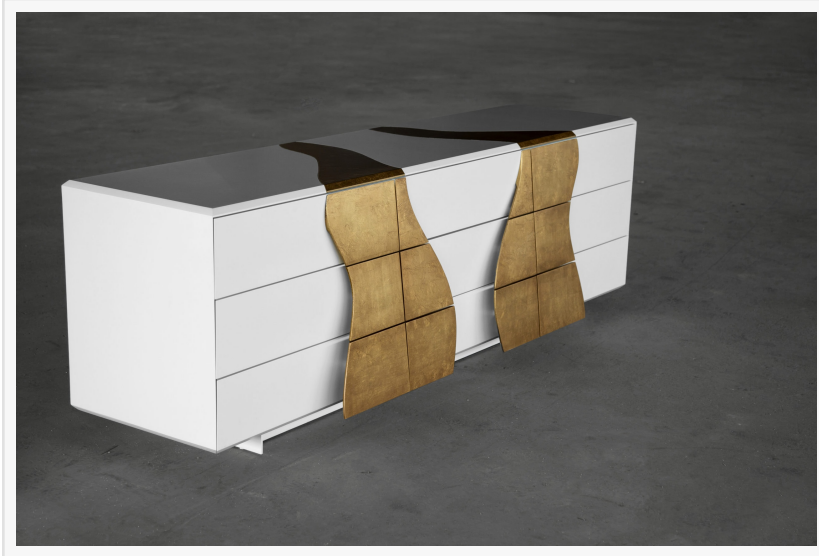
Luxury Console Dresser

SENTIENT ensures all its materials meet certification standards, closing the gap between opulent décor and environmentally conscious furniture. Unlike past designs that overlooked sustainable practices or conscious consumerism, the current trend leans significantly towards green manufacturing and eco-friendly appeal. Property owners, particularly those managing venues, are now more aware of resource conservation, advocating for renewable materials