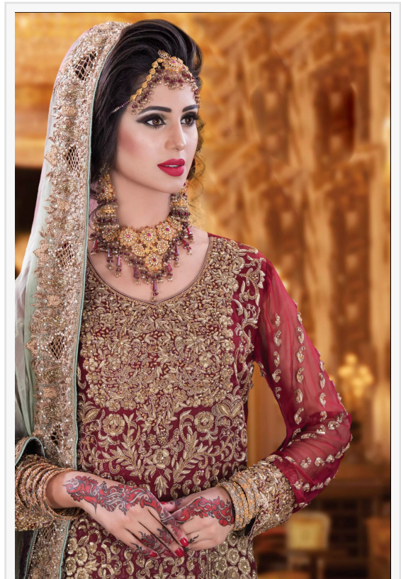
Copper Rust Gharara Shirt Woody Brown Dupatta

signature blend of elegance and sophistication to brides worldwide. With its curated selection of bridal attire and commitment to unparalleled quality, Deemas Fashion is poised to become a go-to destination for brides seeking the perfect ensemble for their special day.