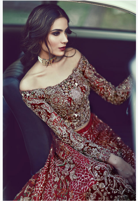
Bright Red Bridal Lehenga – Embroidered Choli – Beige Dupatta

This press release can be viewed online at: https://www.einpresswire.com/article/687278174