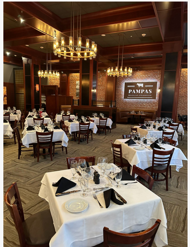
Pampas Brazilian Steakhouse Interior