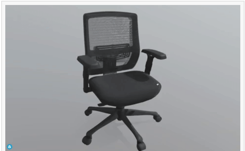
3D image of an office chair all readily available for use in Revit & SketchUp

The managed service provided by JasonL promises a hassle-free experience for the construction industry, taking projects from measurement to delivery, assembly, and installation. This holistic approach aims to simplify the entire fit-out process, ensuring efficiency and timely project completion.