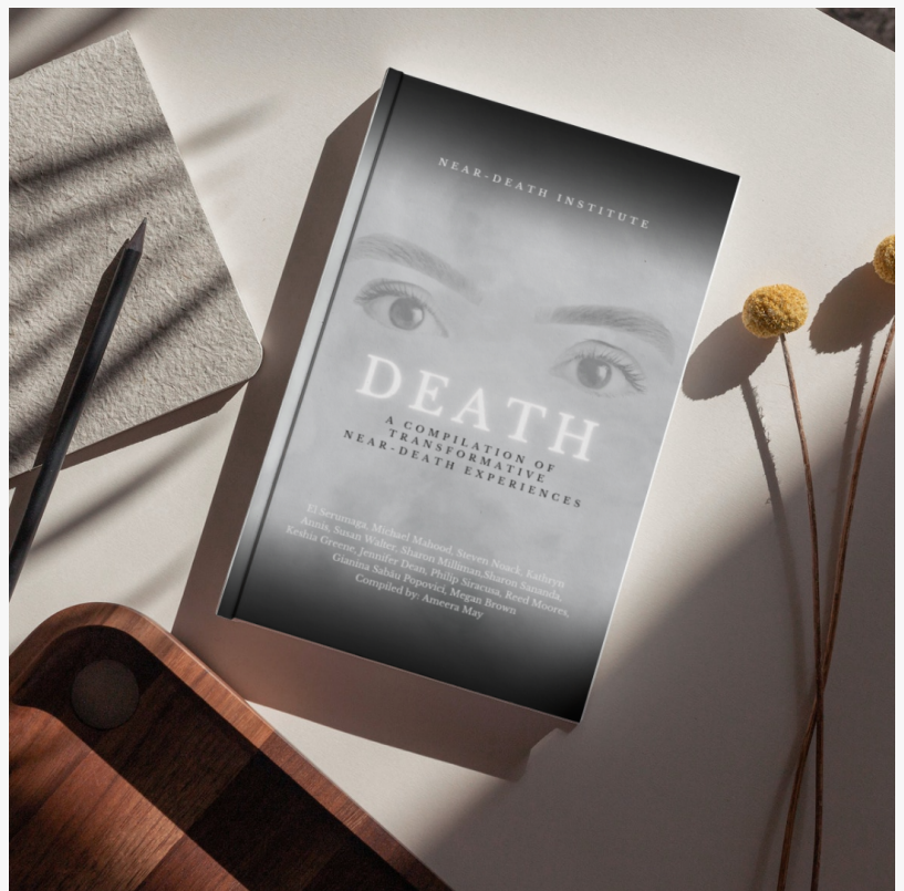
Death - A compilation of transformative near-death experiences. (Hardcover)

In recent years, a cultural shift has been observed as more individuals feel empowered to share their encounters with the "almost dead."