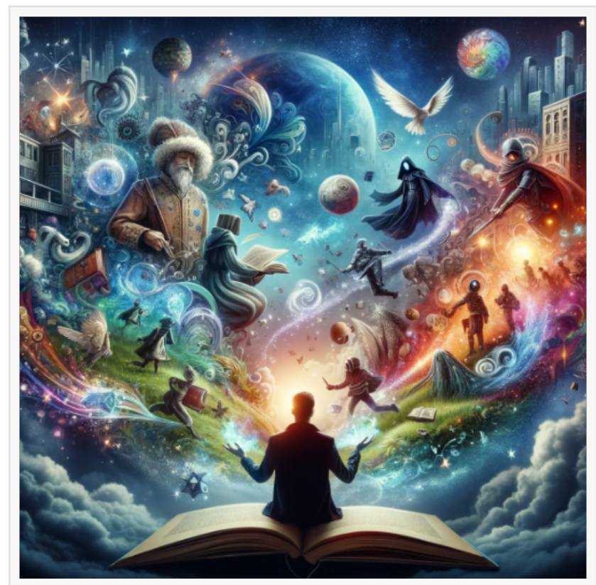
FLASH FICTION ON DEMAND

Flash Gordon Fiction is delighted to provide the Flash Fiction on Demand service at no cost for a limited time. This is your invitation to traverse the limitless realms of creativity without the expense barrier. Please act quickly, for this personalized voyage through the landscapes of your imagination will