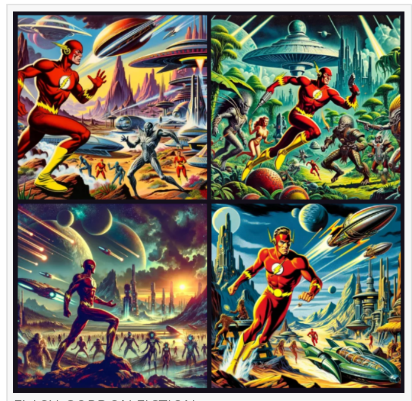
FLASH GORDON FICTION

Flash Fiction, the canvas for this unique service, is an art form that celebrates the succinct without compromising depth. Every word is meticulously chosen, and each sentence is a brushstroke that paints a story as boundless as the cosmos yet contained within a mere fraction of a page.