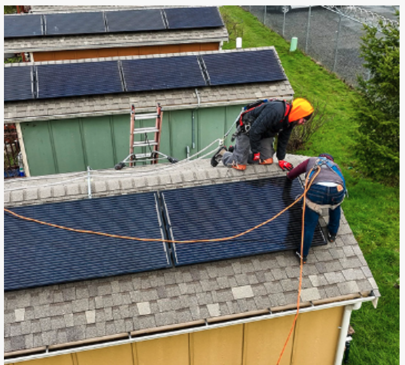
Olympic Community Solar Project

Since 2005 Sunergy Systems, an employee-owned company, has been designing, permitting, and installing solar energy systems and back-up storage using the best technology and craftsmanship for residential applications throughout the entire Puget Sound area. Offering one