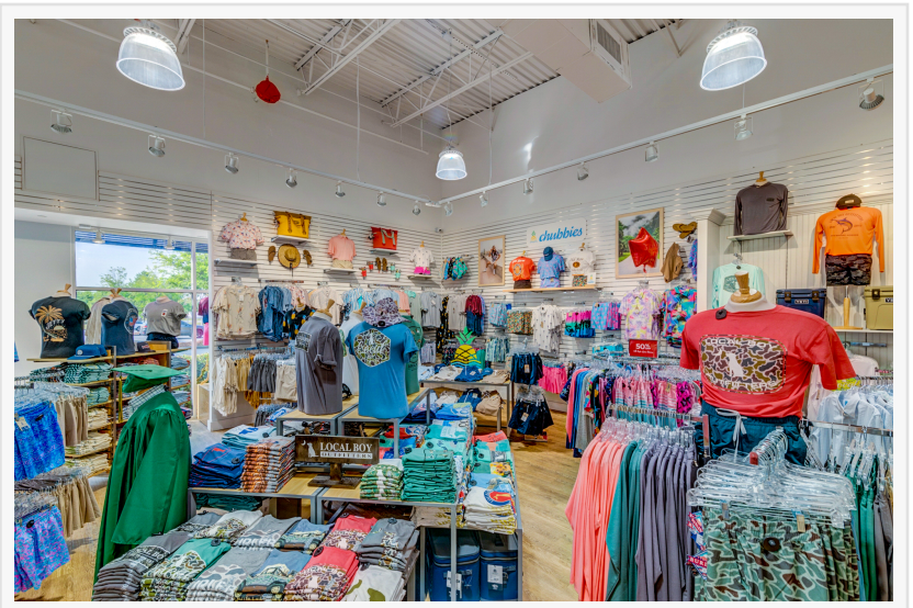
Palmetto Moon Store Interior Displays

Full details on Palmetto Moon's Grand Opening Celebration, including a timeline of events, can be found by visiting the brand's official Facebook event page, at <u>https://fb.me/e/3h6QoJh2K</u>.