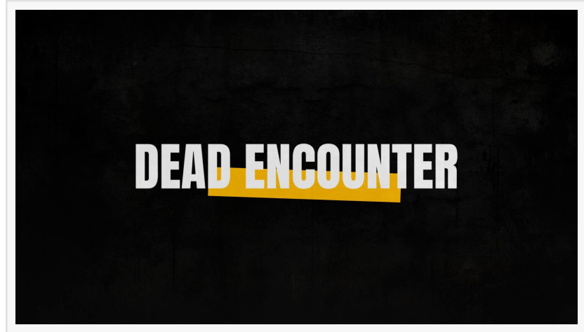
Dead Encounter - Web Series