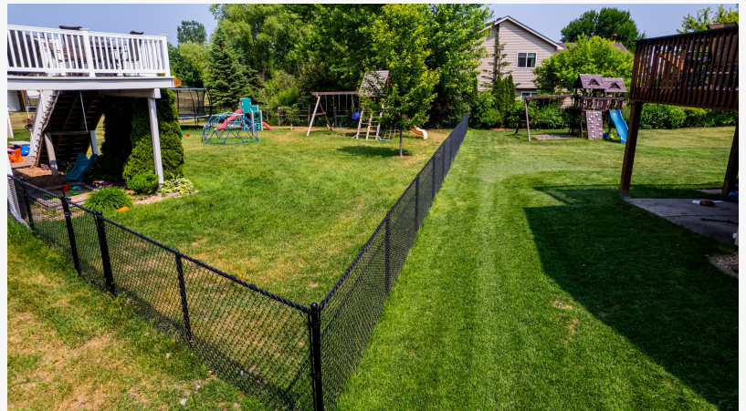
Black Vinyl-Coated Chain Link Fence MN