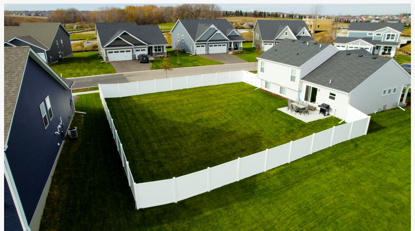
White Vinyl Privacy Fence MN